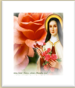
St. Teresa of Lisieux